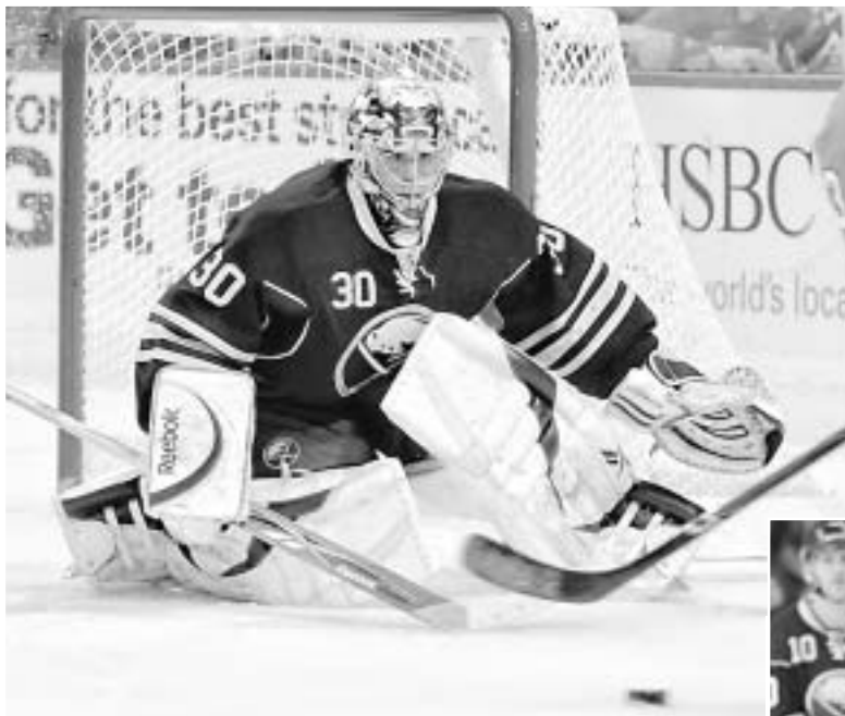
Ryan Miller key to Sabres post-season hopes.

After a recent game, Ruff said he could swear that half the guys on the team had muzzles on. "When you're under pressure the only thing you can trust is someone else's voice and the fact that he has to be in a certain place for us," Ruff explained. "The support has to be there. We've proved it to ourselves as a team that when we have that support and we have that communication we can