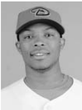
You can't go wrong by drafting Justin (left) or B.J. Upton (right).

Second base Veteran fantasy owners fondly remember when fleet Eric Young patrolled the middle infield in Colorado, and soon Eric Young Jr. may be garnering the same favorable reaction. EY Jr. showed last year the he inherited his dad's speed on the base paths (58 SB for Triple-A Colorado Springs) and line drive power. Clint Barmes is the incumbent 2B in Colorado, but his 23 homers last year at age 30 scream "fluke," and his .245 batting average and .294 OBP scream "mediocre." Barmes' super-